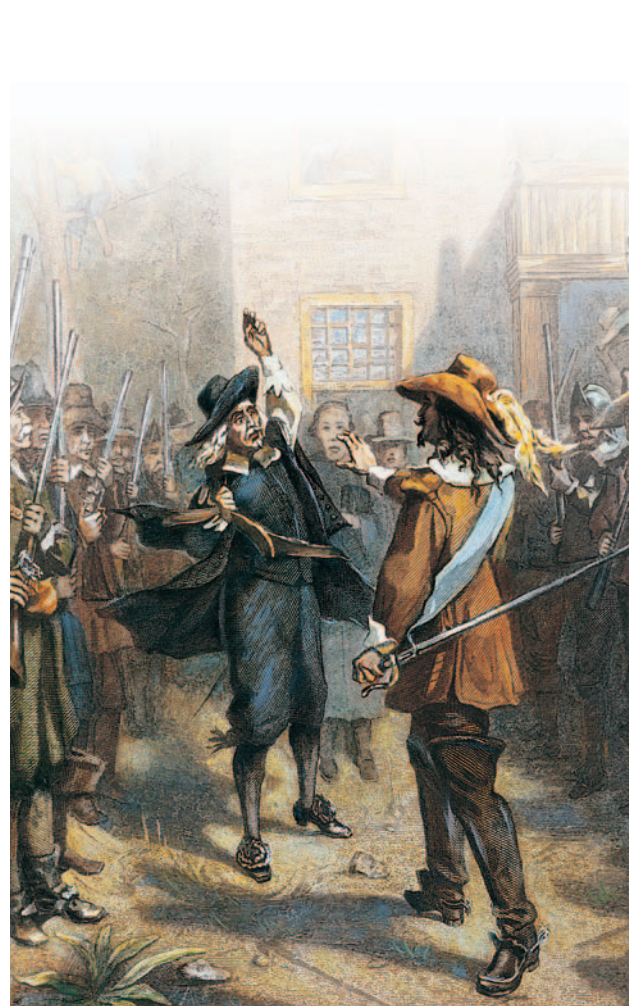
Nathaniel Bacon (right) confronts Virginia governor William Berkeley at Jamestown in 1676.

Bacon marched into Jamestown, took control of the House of Burgesses, and burned Jamestown to the ground. Bacon's sudden illness and death ended the rebellion. Berkeley hanged Bacon's followers. Angered by Berkeley's actions, King Charles II recalled the governor to England. After that incident, the House of Burgesses passed laws to prevent a royal governor from assuming such power again. The burgesses had taken an important step against tyranny. In the next section, you will read about the New England colonies and their steps toward independence.