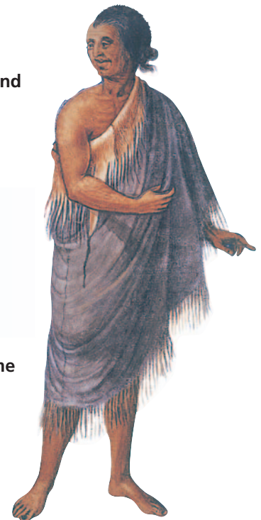
Drawing by John White of an old man of the Pomeiock tribe.

To his shock and grief, he found no trace of the colonists or his granddaughter, all of whom had disappeared. The only clues to their whereabouts were the letters CRO carved in a tree and the word Croatoan carved in a doorpost. White never discovered the fate of his family and the other colonists. In this section, you will learn why English settlers such as White came to America despite such hardships.